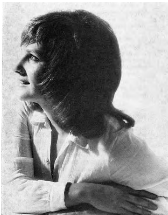
Norma Burrowes, soprano Dec.73